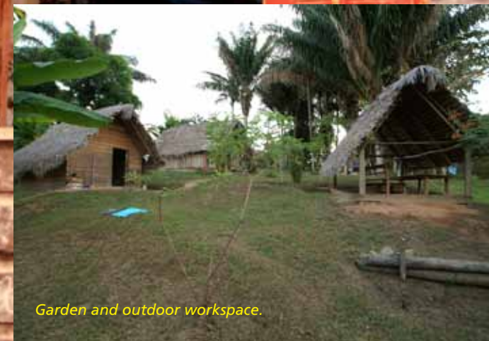
Garden and outdoor workspace.