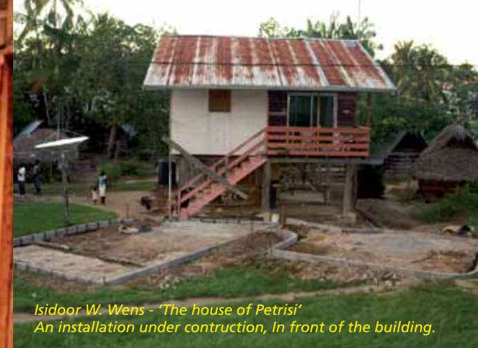
Isidoor W. Wens - 'The house of Petrisi' An installation under construction, In front of the building.